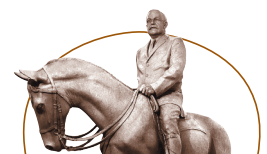
HARRY C. TREXLER TRUST

underwrite operating expenses of the soup kitchen in the church basement . . . . . $5,000.00