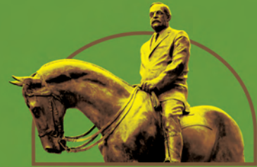
HARRY C. TREXLER TRUST